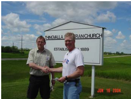
Icelanders give to Thingvalla Memorial